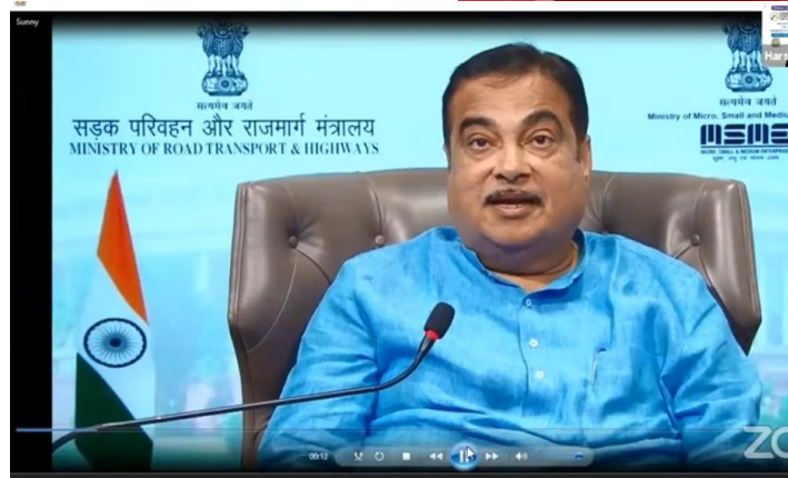
Message from Hon'ble Minister Shri Nitin Gadkari